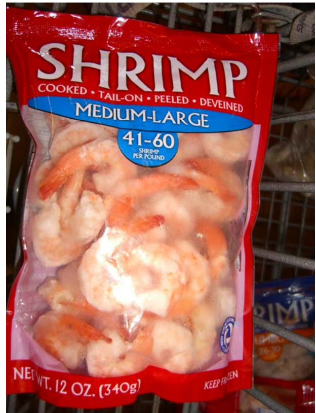
Wal-Mart private label shrimp supplied by Narong Seafood.

Acknowledging the well-documented problems of food quality, environmental degradation, and labor rights violations endemic to the global aquaculture industry, Walmart joined BAP. Unfortunately, recent incidents at Phatthana Seafood (Songkhla Province), a supplier to Walmart and other US retailers and restaurants raise questions about the effectiveness of the industry's reform initiatives. In April 2012, Human Rights Watch reported on a strike at a Walmart seafood processing factory in Thailand's southern province of Songkhla; the factory, owned by