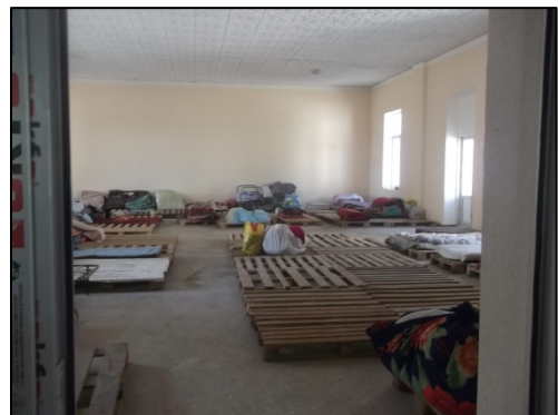
Accommodations for children and adults sent to pick cotton in Syrdarya region, September 2013.