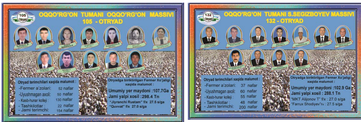
Authorities in Akkurgan, Tashkent region, issued these photos of “Brigade 105” (left) and “Brigade 132,” (right) that includes details of how many people worked in the brigades, how much cotton they harvested and which farms they worked on.

This report updates the Review of the first month of the 2013 Cotton Harvest in Uzbekistan . The evidence presented herein on the continued use of forced labour in the 2013 cotton harvest was gathered by human rights defenders in Uzbekistan through interviews and observations during the harvest. They also reviewed government documents and collected both local and international media reports on the cotton harvest. Information was gathered from seven regions. Each region had a group of local monitors who monitored the cotton harvest from beginning to end. All interviewees had direct experience of participating in the 2013 cotton harvest. The interviewees were from different families and different schools. The teams of human rights defenders received training on monitoring and interview techniques by a social scientist. The monitoring teams operated anonymously for their personal protection.