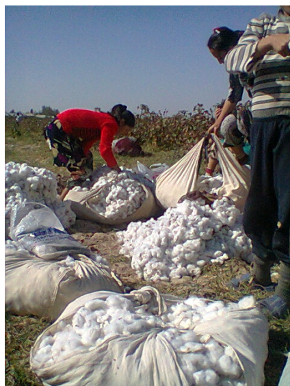
School administrators sent schoolchildren to pick cotton in Yakkabog district, Kashkadarya region, October 2013.