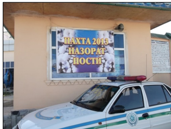
Police office to oversee the cotton harvest, Syrdarya region, September 2013.

When the ILO monitors arrived in September, government authorities throughout the country had already instructed citizens to report to foreigners that they picked cotton “for the love of the motherland.” 95 Even private business owners in Tashkent region followed orders to instruct their staff to respond to questions from the ILO mission by stating that they picked cotton “voluntarily, to raise the economy of the country and work hard for our motherland.” 96 Education officials instructed students to report being over age 18 if they are asked by foreigners while picking cotton and returned students from the cotton fields to schools in anticipation of visits by the ILO. 97 Fergana regional authorities ordered all residents to have children pick cotton away from main highways. 98 In advance of an ILO visits to colleges, school officials sent the students back to school from the cotton fields. 99 A student wrote to Radio Liberty, “I am first-year student from Samarkand Judicial College. We were also sent to pick cotton. Our teachers told us that if the Commission comes we should say that we are second-year in the college. What is happening? It seems illegal.” 100