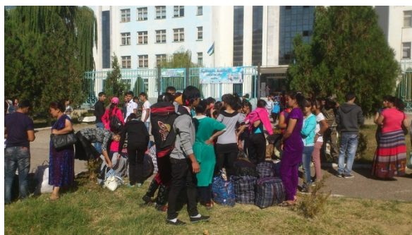
Mobilization of college students, September 16-17, 2013, Tashkent region.