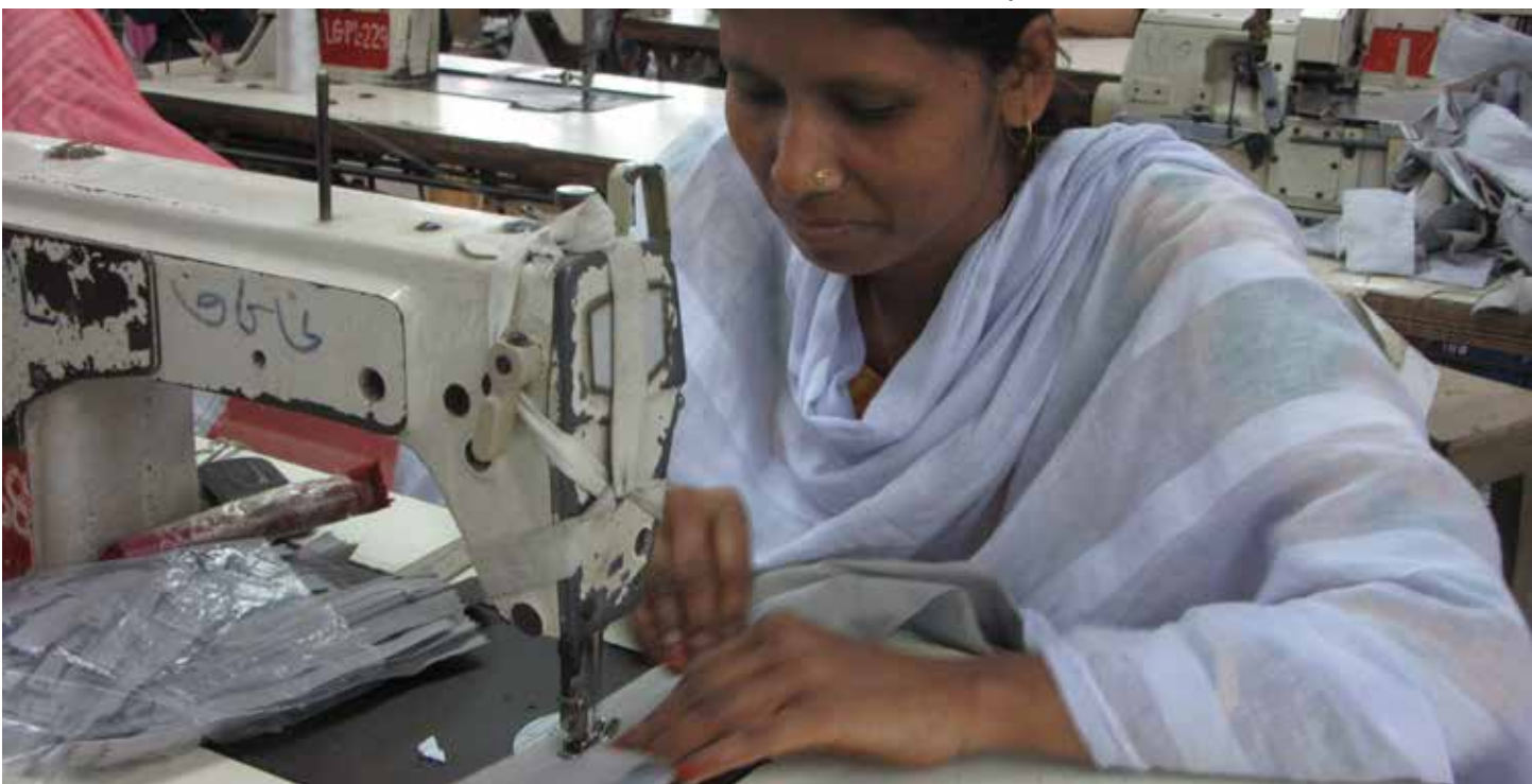
Factory-level union leader at Luman Fashion.

What did the owner say when you told them after unionizing that there are fires in the boiler? The owner fixed it.