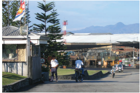
Security Station at the Entrance of Dole Philippines

testimony at the USTR hearing marked the first time that the labor consideration was applied to the trade benefits associated with a product under the GSP system. A final decision from the USTR on ILRF's request to deny Dole Philippines extra trade benefits is expected in mid-2009.